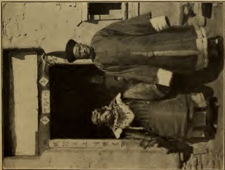
A BRIDAL PAIR.